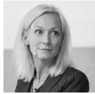
Cecilia Bonefeld-Dahl Director-General DIGITALEUROPE